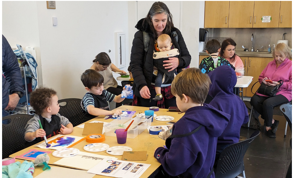
Studio and Storytime at Tacoma Art Museum

Up and Atom STEAM Days GRADES K–8 Thursdays at 3:30 p.m. Join us to try out different STEAM and craft activities. • February 5: Super STEM Bowl! • February 12: K'Nex Bridges • February 19: Snow Shovel Challenge • February 26: Art Workshop with Tacoma Art Museum, funded by the City of Tacoma/Tacoma Creates