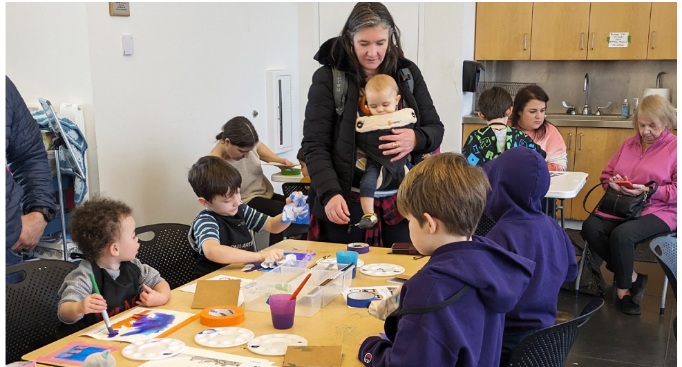
Studio and Storytime at Tacoma Art Museum

Come join us for an evening of stories, activities, and songs.