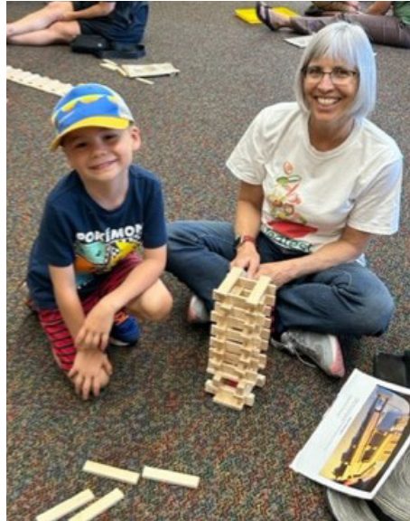
Building with KEVA planks during Up and Atom STEAM Days

Play to Learn | BABY AND PRE-K Fridays at 10 a.m. | February 13, 20, 27 For children and caregivers to enjoy play together with fun group activities. Presented by Greentrike, funded by the City of Tacoma/Tacoma Creates, and hosted by TPL.