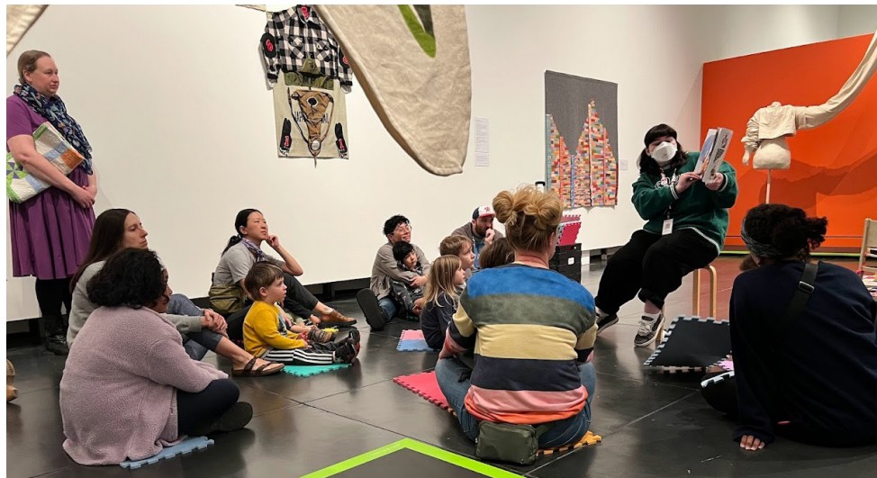
Studio and Storytime at Tacoma Art Museum

Fun for you and your baby with songs, rhymes, stories, and movement.