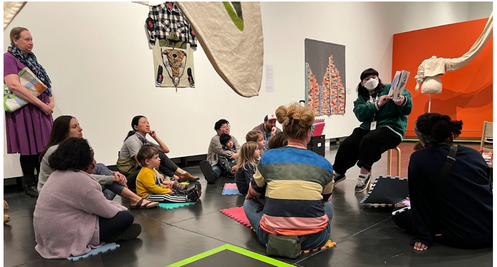
Studio and Storytime at Tacoma Art Museum

Join us for stories, songs, and fun learning activities that the whole family can enjoy.