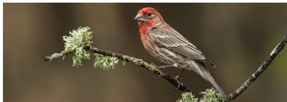
Colorful Backyard Birds with Tacoma Nature Center.