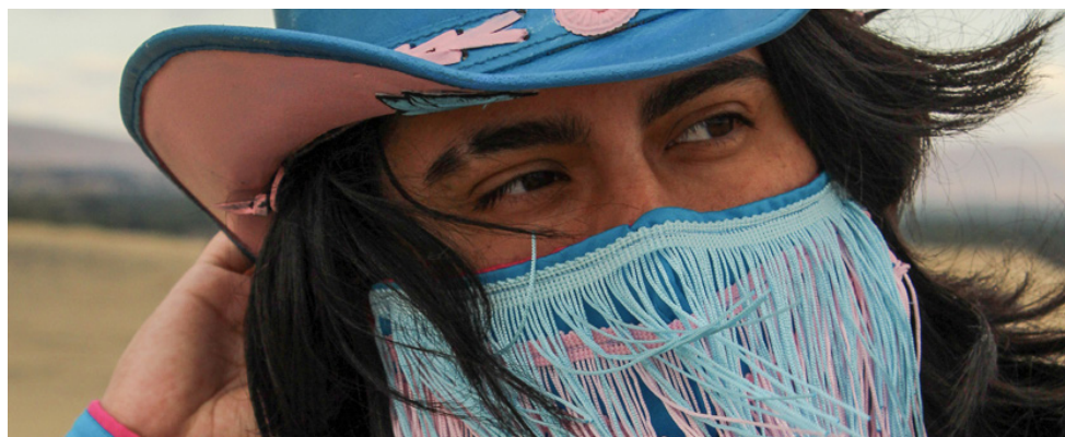
Teen Art Workshop with artist Vaquero Azul.

Wednesday, July 16 at 12:30 p.m. Follow step-by-step printed instructions or DIY to create your own masterpieces.