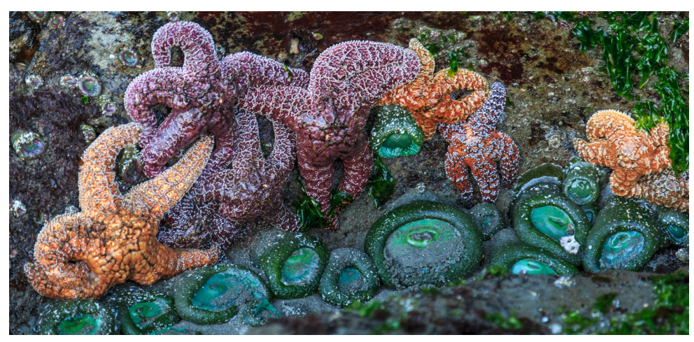
Beach Walks with Harbor WildWatch.

All Tacoma Public Library locations will be closed on Friday, July 4, in observance of Independence Day.