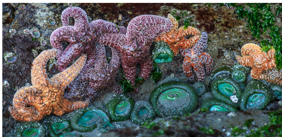
Reading the Tidepools at Titlow Beach with Tacoma Nature Center.

Pajama Storytime | ALL AGES online (Zoom) | Tuesdays at 7 p.m. June 3, 10, 17, 24 Come join us for an evening of stories, activities, and songs.