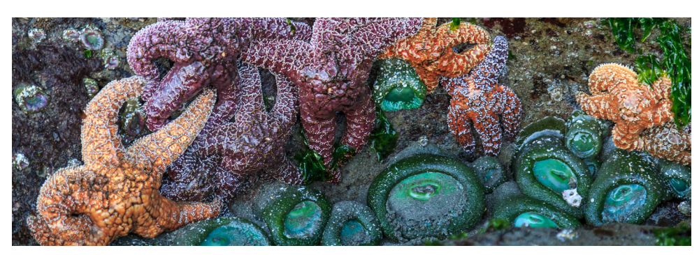
Reading the Tidepools at Titlow Beach with Tacoma Nature Center.

Pajama Storytime | ALL AGES online (Zoom) | Tuesdays at 7 p.m. June 3, 10, 17, 24 Come join us for an evening of stories, activities, and songs.