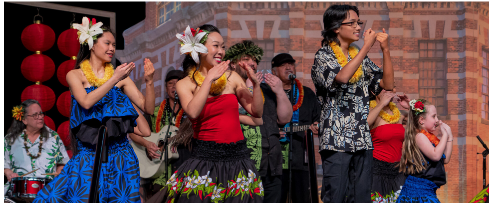
Asia Pacific Cultural Center presents Hawaii.

Tacoma Wayzgoose is a community letterpress, printmaking, and book arts extravaganza. Meet local printers and view their wares, print your own keepsakes, make paper, and bind books. A highlight of the weekend is steamroller printing, where local artists carve 2' x 3' foot sheets of linoleum and print on giant paper. Presented with Write253.