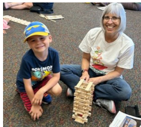
Keva Planks at Up and Atom STEAM Days

Join us May 1-31 at the Kobetich, Moore, Mottet, South Tacoma, Swasey, and Wheelock Libraries to learn about different Asian American, Native Hawaiian, and Pacific Islander authors and their great books!