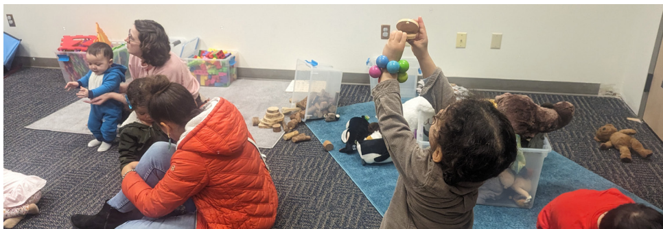
Play to Learn event at Fern Hill Library.

AGES 3+ | Fern Hill, Kobetich, Moore, Mottet, South Tacoma, Swasey, Wheelock Pick up starting Friday, April 12, while supplies last.