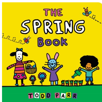
The Spring Book by Todd Parr