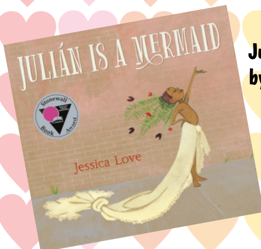
Julián is a Mermaid by - Jessica Love