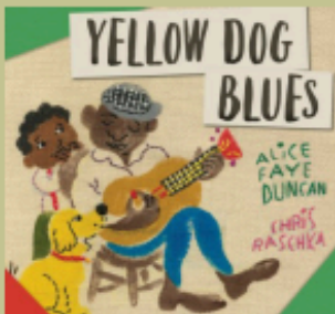
Yellow Dog Blues by Alice Faye Duncan