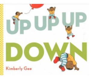
Up, Up, Up, Down Kimberly Gee