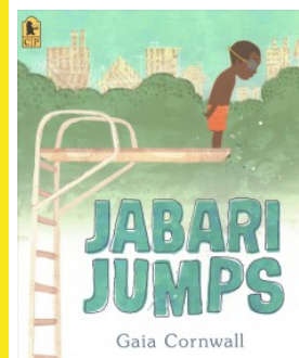
Jabari Jumps Gaia Cornwall