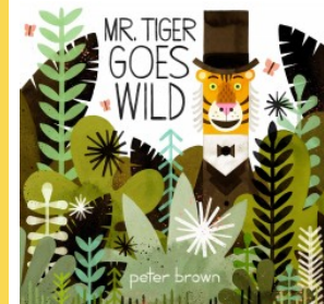
Mr. Tiger Goes Wild Peter Brown